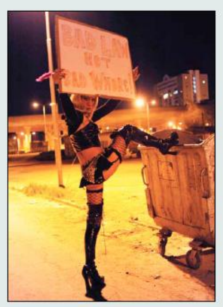
"To address HIV in sex workers will need sustained community engagement and empowerment, continued research, political will, structural and policy reform, and innovative programmes. But such actions can and must be achieved for sex worker communities everywhere."